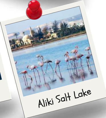
Aliko Salt Lake